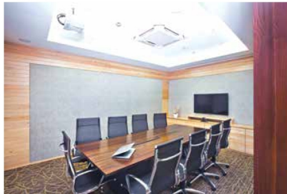
The conference room has a huge table and wall panelling fashioned out of Hemlock.