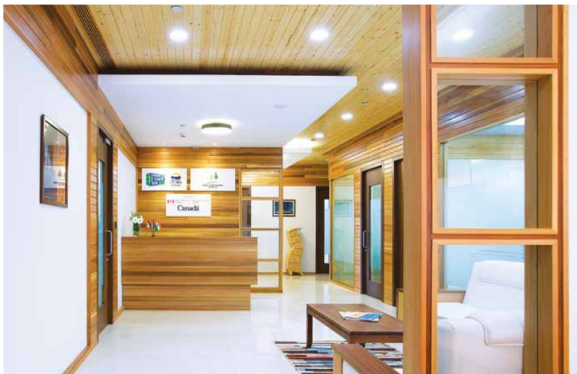
SPF and Western Red Cedar adorn the roof and walls of the reception.

Entering the office-cum-display centre you are transported to a different world! The wall panelling is Western Red Cedar, the roof sports SPF panels, and the furniture is from impressively stained Yellow and Red Cedars.