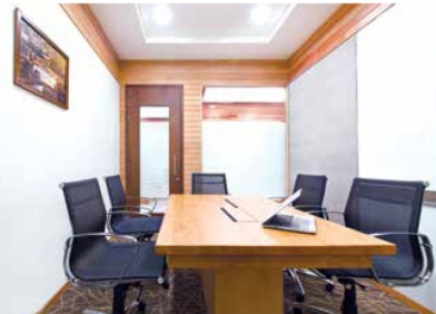
The Douglas Fir Room is so named after the use of the species in the wall panelling and table.

The latter are also suitable for the outdoors, being naturally resistant to termite and fungus infestation. The sand-tight knots in some of the panels – retained on purpose to demonstrate their durability and inherent beauty – become part of the grain and do not come off.