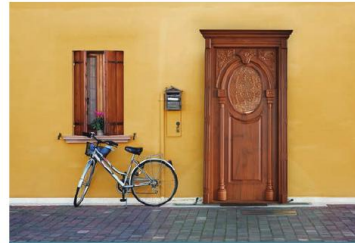
Beautifully carved Western Red Cedar solid wooden door with glass insert

A more economical option is the use of flush doors. Featuring veneer on both sides of the construction with a solid or hollow core, most flush doors have free-floating center panels