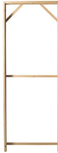
Chaukhat in Yellow-Cedar STK

types of mouldings, carvings, panel configurations, stains, finishes and looks can be incorporated. Given the technology and labour available in the country, wooden doors are also relatively easier and cheaper to repair and maintain.