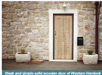
Sleek and simple solid wooden door of Western Hemlock

For decades wood has held a special place in architectural usage, earlier as an only option to becoming a popular choice today. A wooden door can be custom crafted in any shape or size and all