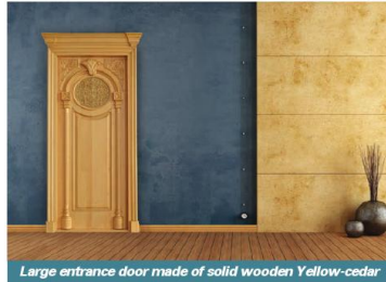
Large entrance door made of solid wooden Yellow-cedar

surrounded by stile-and-rail frames. Spruce-Pine-Fir's (SPF) strength and stability makes it ideal in the framing of a flush door.