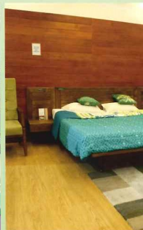
Bedroom set, furniture and wall panelling in western hemlock on display