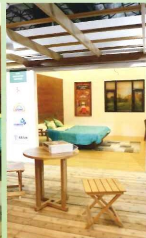
Decking and pergola in western red cedar