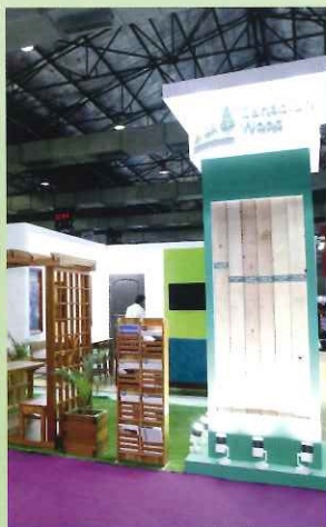
Canadian Wood booth at Index 2019