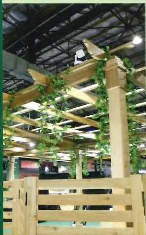
Western red cedar pergola and screens at the Gold Lounge