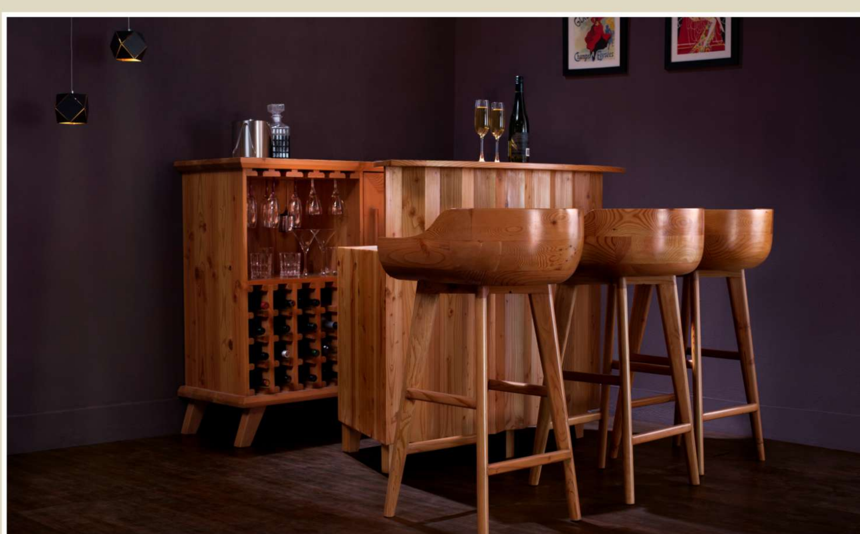
Douglas-fir bar furniture

Vintage : Consumer trends are increasingly showing an inclination for vintage look furniture that blends traditional designs with modern materials and functionality. Traditional design styles are instantly recognizable and guaranteed to look stylish for years to come. While the last decade was all about furniture that adhered to clean straight lines, now curves have returned. And 2022 will see more rounded shapes and stylish looks.