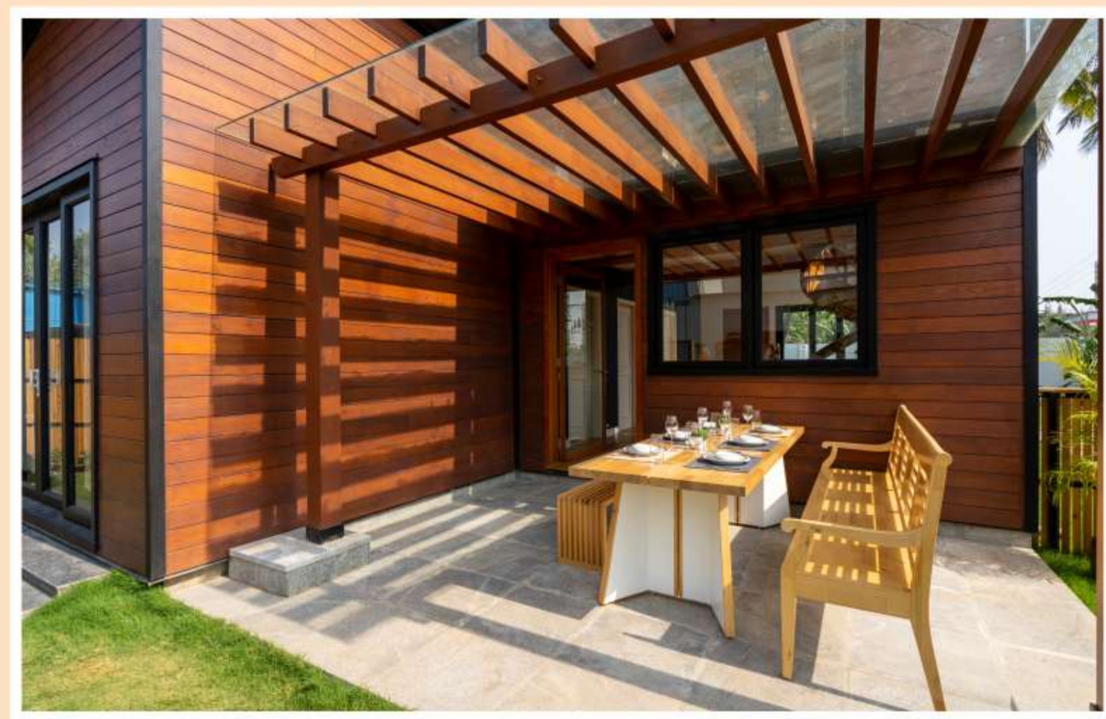
Western red cedar pergola. Western hemlock bench and table.

Natural: One of the responses to the COVID-19 pandemic has been the emerging need for homes to be serene and relaxing, a kind of sanctuary for people with stressed lives. Along with being functional, people want their homes to be uplifting and comforting. And what better choice of material than wood. Wood due to its natural beauty provides a feeling of wellness to the human mind. The health benefits to humans on account of living in wooden homes or surroundings are well established.