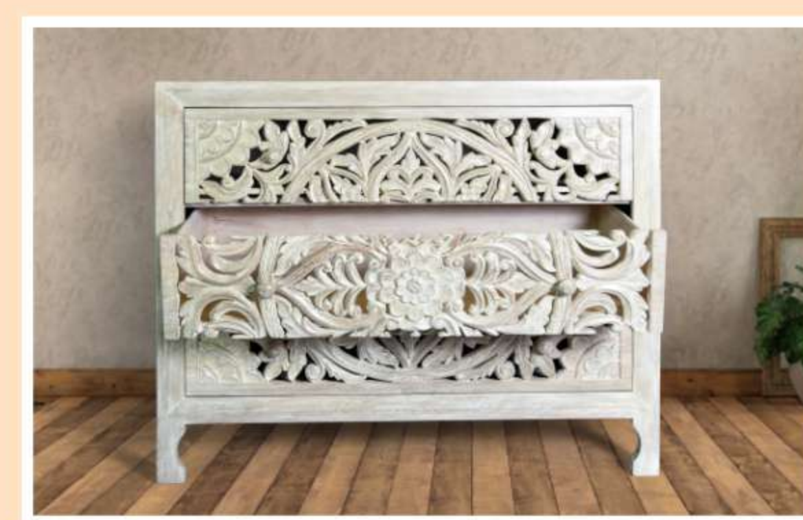
Hand-crafted chest of drawers made with Western hemlock

Bespoke: The rise in the popularity of the vintage furniture trend has also led to the revival of traditional craftsmanship. More and more designers and manufacturers have realized that the traditionally crafted furniture will also generate employment for local craftsmen and skilled workers.