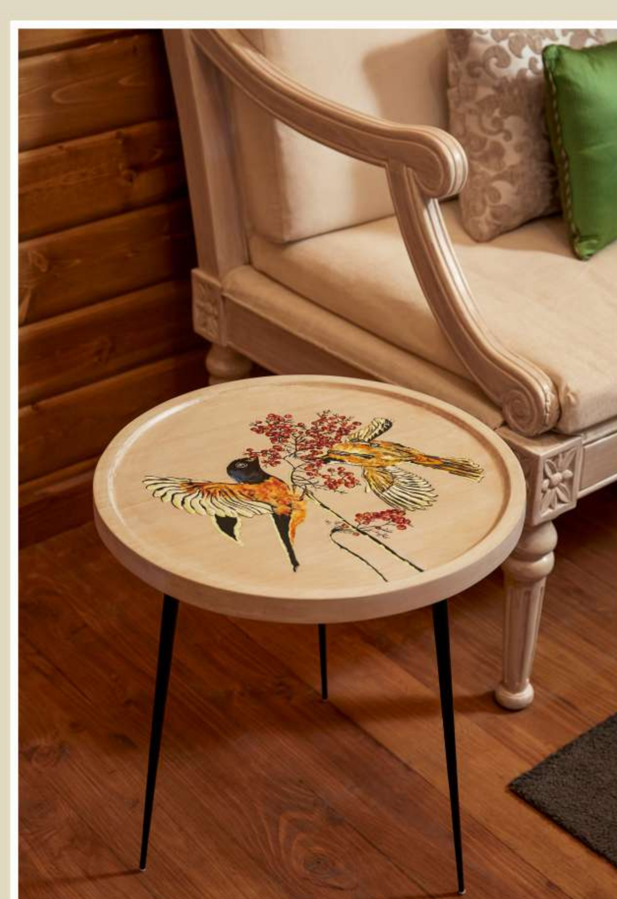
Hand painted Western hemlock furniture

Bespoke: The rise in the popularity of the vintage furniture trend has also led to the revival of traditional craftsmanship. More and more designers and manufacturers have realized that the traditionally crafted furniture will also generate employment for local craftsmen and skilled workers.