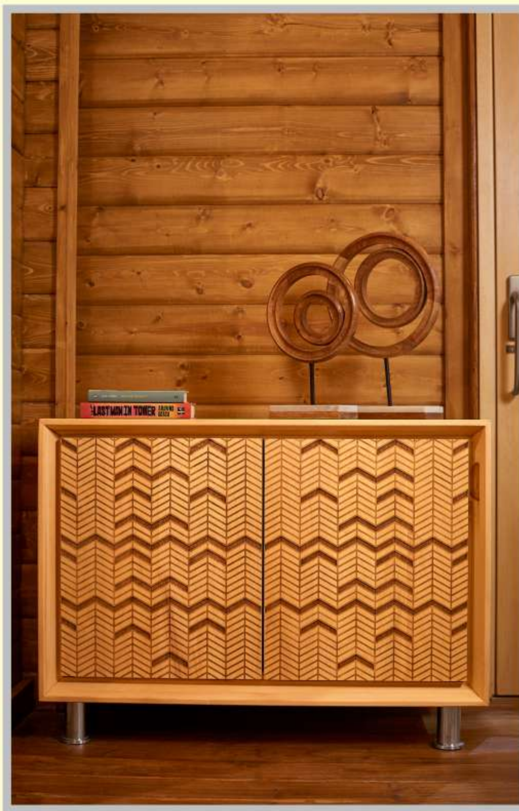
Yellow cedar cabinet