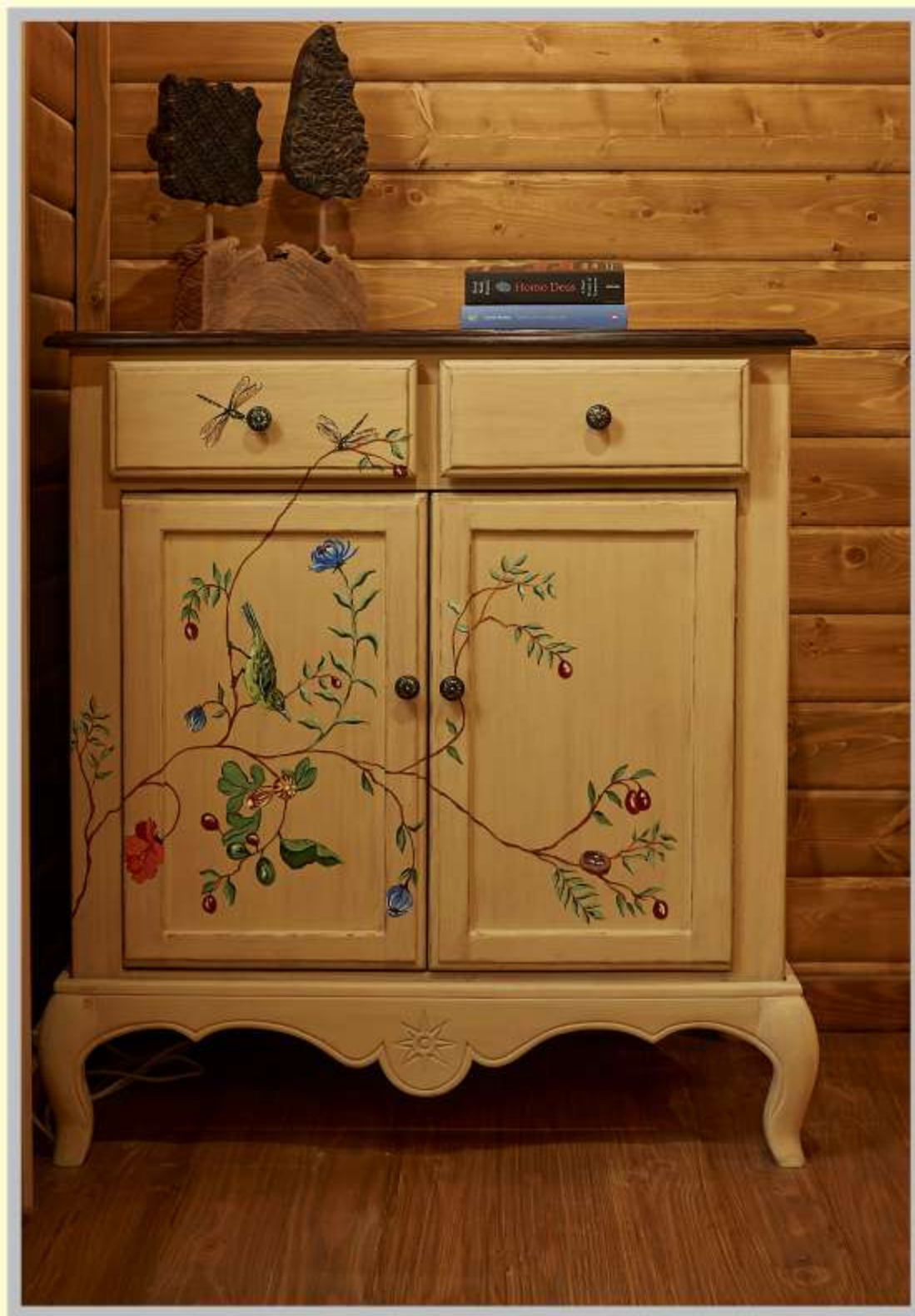
Western hemlock cabinet with hand-painted motifs

Wood from sustainable sources: Responsible consumption is the order of the day. Consumers would like to buy furniture which is aesthetic and functional while also leaving a positive environmental impact. Many designers and architects are turning to wood from sustainable sources as they consider it their responsibility to help mitigate global warming and climate change. They are mindful of the global trend of using eco-friendly materials for furniture. The focus is thus on natural materials such as wood for not just furniture but many other interior applications.