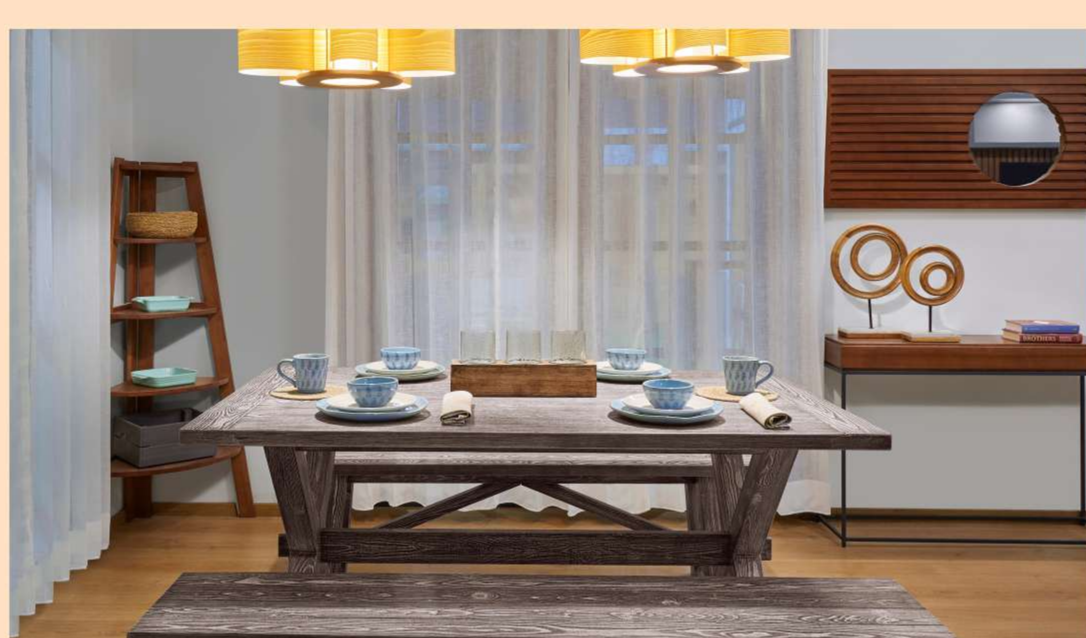
Douglas-fir dining table

We all know that the furniture industry in India has been highly fragmented, with many small carpentry shops in the unorganized sector dotting the landscape across the country. However, it is heartening to note the recent trend of serious entrepreneurs entering the industry by infusing investments to mechanize and modernize the industry. This has helped expand the organized sector in the furniture industry, thereby providing better value to customers and generating employment for the well-skilled workforce.