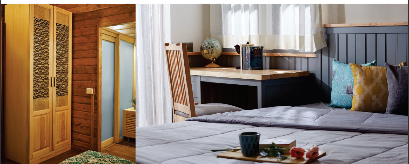
Beautiful, functional and comfortable - Bedroom furniture made with Canadian wood

Be it the beauty of design, functionality, or strength when it comes to furniture products, Canadian wood species are the right fit for home furniture across the globe, both indoors and outdoors. Given that in the new normal, homes have emerged as a place to live, work, play and enjoy, people are preferring furniture that fits in with this new lifestyle and fulfills all their needs without bothering them much about the monetary considerations.