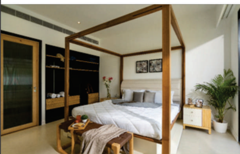
Canadian wood indoor furniture to brighten the space