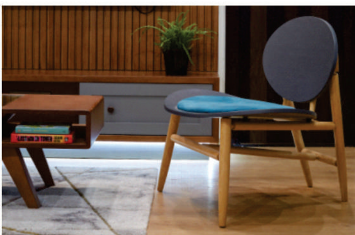
Compact and trendy by design - Lounging set