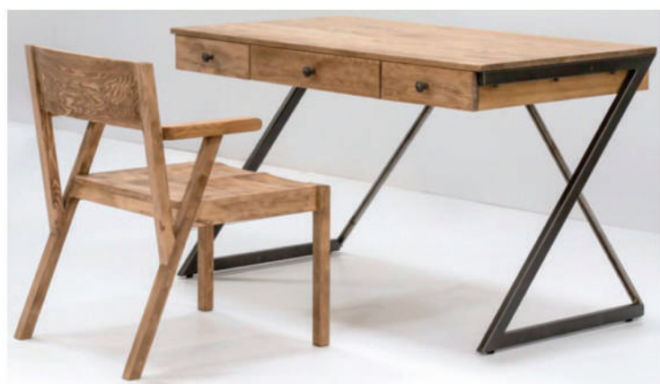
Minimal by design - Western hemlock chair and desk

All the Canadian wood species are lighter in colour and weight as compared to the traditional tropical species. Hence furniture made with these species offers the much-needed feeling of space in tight corners. They are also a breeze to lift and shift as required. Amongst all Canadian wood species, western hemlock is the most sought after by manufacturers for making indoor furniture and interior panelling. It gets an edge over the traditional hardwoods due to its even grain, excellent machining and coating properties.